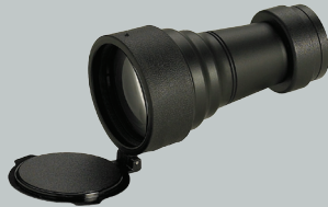
5x Magnifier Lens