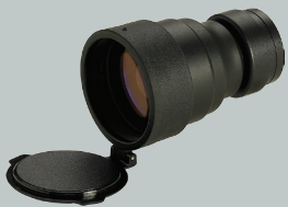
3x Magnifier Lens