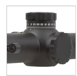
Locking, zero stop, multi turn elevation dial.