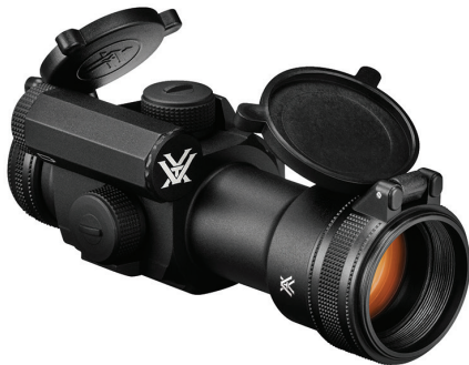
Low Ring Mount Option (21 mm Height)