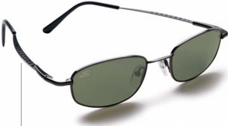
AUTOBAHN BASE CURVE: 6 TEMPLE LENGTH: 135MM/SPRING HINGES LENS SIZE: 50.25 X 31.5 X5 0.75MM, DBL 19.5MM *GG6598: GUNMETAL (RX 8198, TEMPLE 7198)