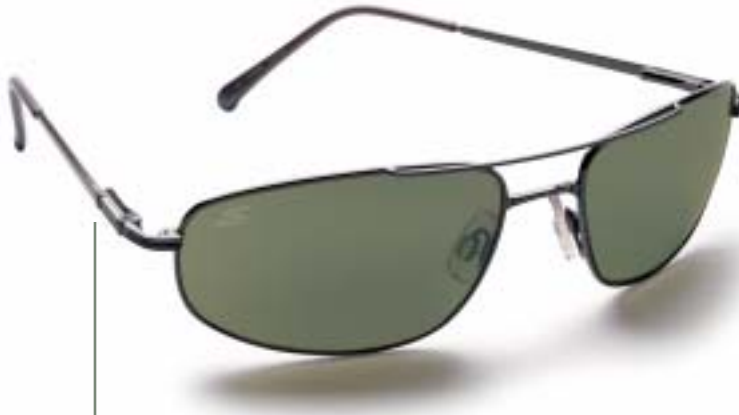
VELOCITY TITANIUM BASE CURVE: 8 TEMPLE LENGTH: 130MM/SPRING HINGES LENS SIZE: 60 X 39 X 62MM, DBL 16MM *GG6692: GUNMETAL (TEMPLE 7292)