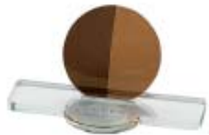
DUAL TRANSMISSION LENS HOLDER PR-509