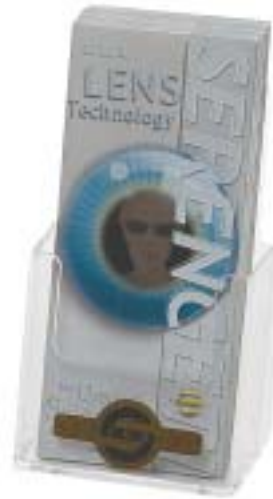
LENS TECHNOLOGY BROCHURE SS-421