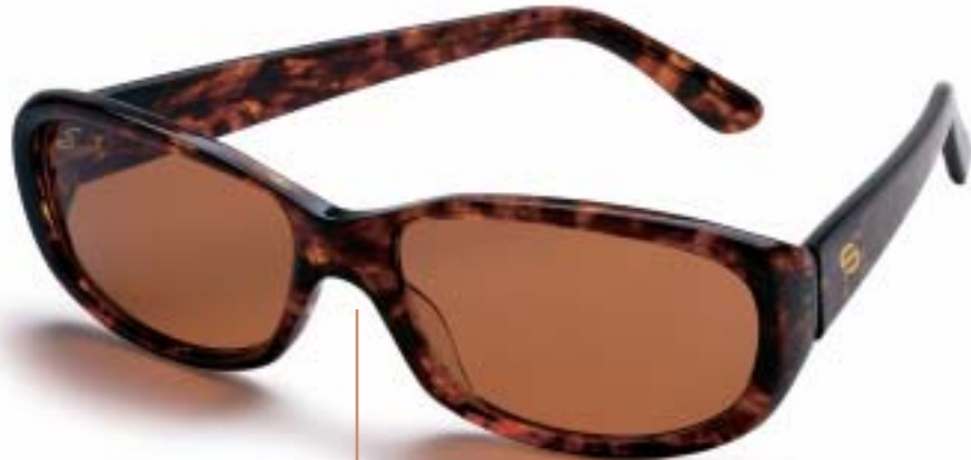
RAQUEL BASE CURVE: 6 TEMPLE LENGTH: 130MM LENS SIZE: 54 X 31.8 X 53.9MM, DBL 17MM *6798: TORTOISE 6799: SHINY BLACK