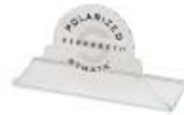
LOGO PLAQUE - STRATA POLARIZED PR-510