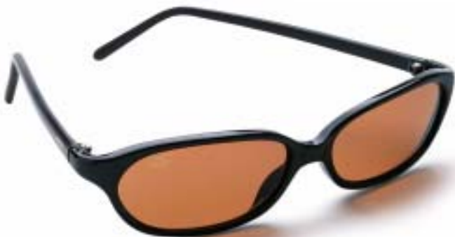
ARABELLA BASE CURVE: 6 TEMPLE LENGTH: 133MM LENS SIZE: 55 X 28.2 X 53.4MM, DBL 16MM *6800: SHINY BLACK 6801: TORTOISE