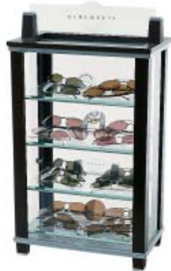
COUNTER DISPLAY (24 PIECE) 26" H x 15.5" W x 9.25" D PR-500

Serengeti® offers a wide range of materials to help you make an impact with Serengeti products and increase sales. You'll find a variety of merchandising tools intended to improve product presentation and to educate consumers about the benefits of Serengeti eyewear.