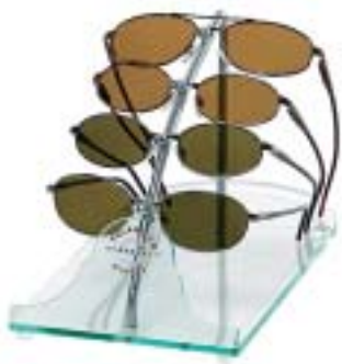
4-PIECE TIERED MERCHANDISER FOR STRATA PR-513