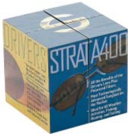
LENS TECHNOLOGY "MAGIC CUBE" SS-423