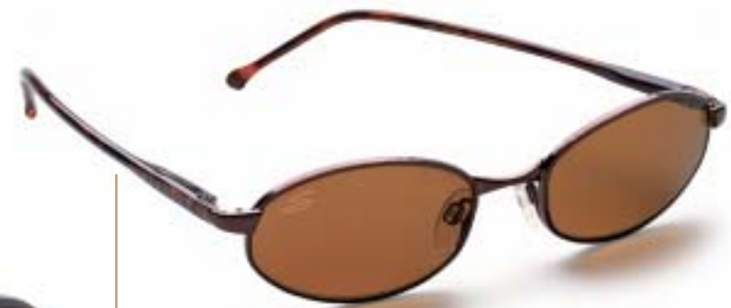
ILIAD BASE CURVE: 6 TEMPLE LENGTH: 135MM/SPRING HINGES LENS SIZE: 50 X 32.3 X 50.8MM, DBL 19MM *6744: HENNA WITH TORTOISE (RX 8344)