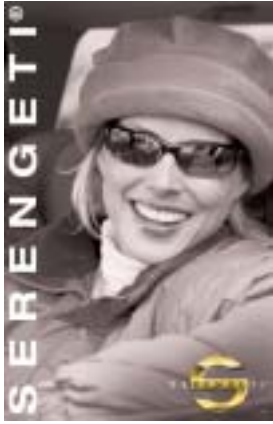
WINDOW BANNER 2-SIDED SS-431