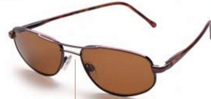
MILOS BASE CURVE: 6 TEMPLE LENGTH: 135MM/SPRING HINGES LENS SIZE: 56 X 36.7 X 59.2MM, DBL 17MM *6742: HENNA WITH TORTOISE (RX 8342)