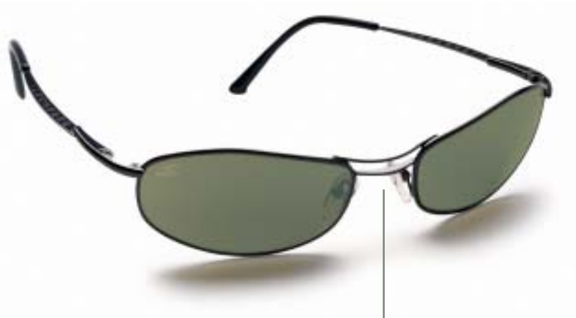
VIA VENETO BASE CURVE: 8 TEMPLE LENGTH: 125MM/SPRING HINGES LENS SIZE: 56 X 33 X 55.5MM, DBL 17.5MM *GG6732: GUNMETAL (RX 8332, TEMPLE 7332)