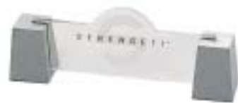
LOGO - MONUMENT PR-504