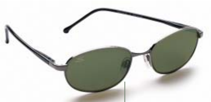
EPIROS BASE CURVE: 6 TEMPLE LENGTH: 135MM/SPRING HINGES LENS SIZE: 53 X 37.2 X 54.4MM, DBL 19MM *6793: GUNMETAL WITH SHINY BLACK