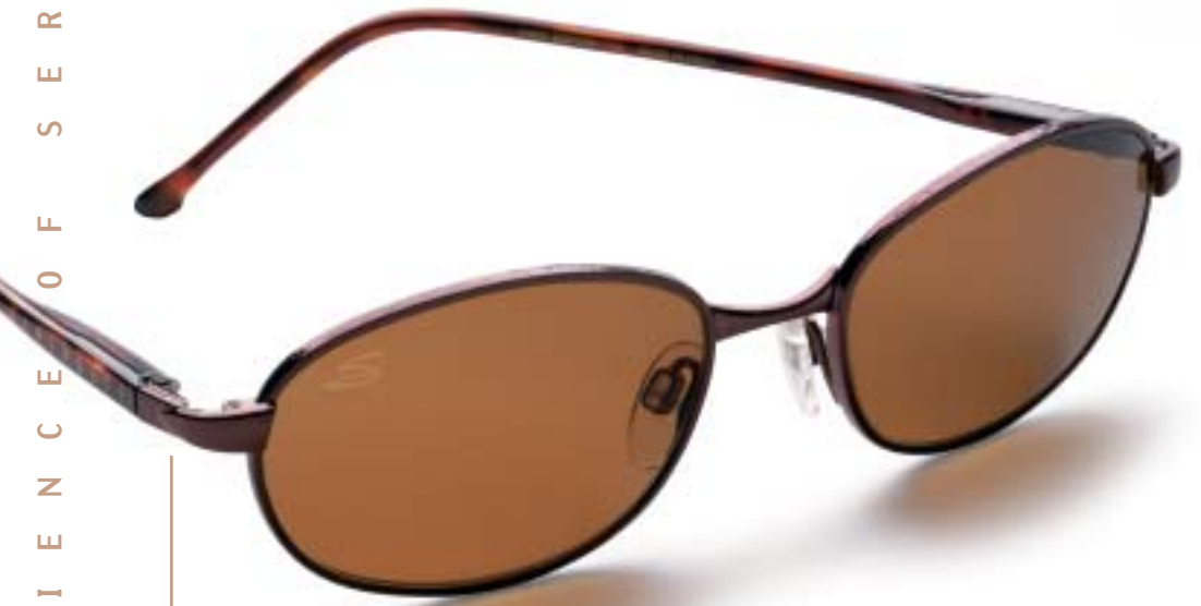
EPIROS BASE CURVE: 6 TEMPLE LENGTH: 135MM/SPRING HINGES LENS SIZE: 53 X 37.2 X 54.4MM, DBL 19MM *6743: HENNA WITH TORTOISE (RX 8343)

18% LIGHT TRANSMITTANCE LIGHTENED STATE 10% LIGHT TRANSMITTANCE DARKENED STATE