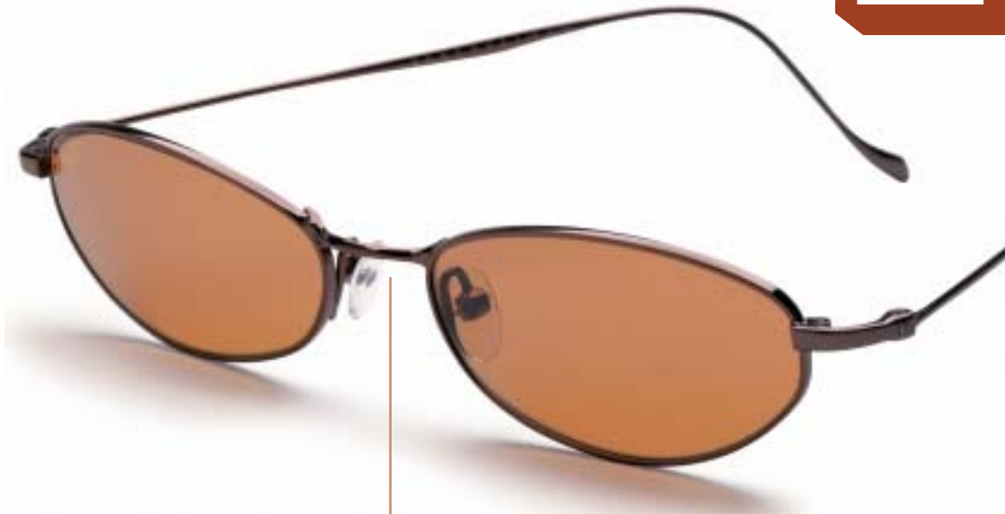
AUGUSTINE TITANIUM BASE CURVE: 6 TEMPLE LENGTH: 140 MM LENS SIZE: 51.0 X 29.5 X 51.4MM, DBL 17MM *6775: HENNA (RX 8175, TEMPLE 7175)