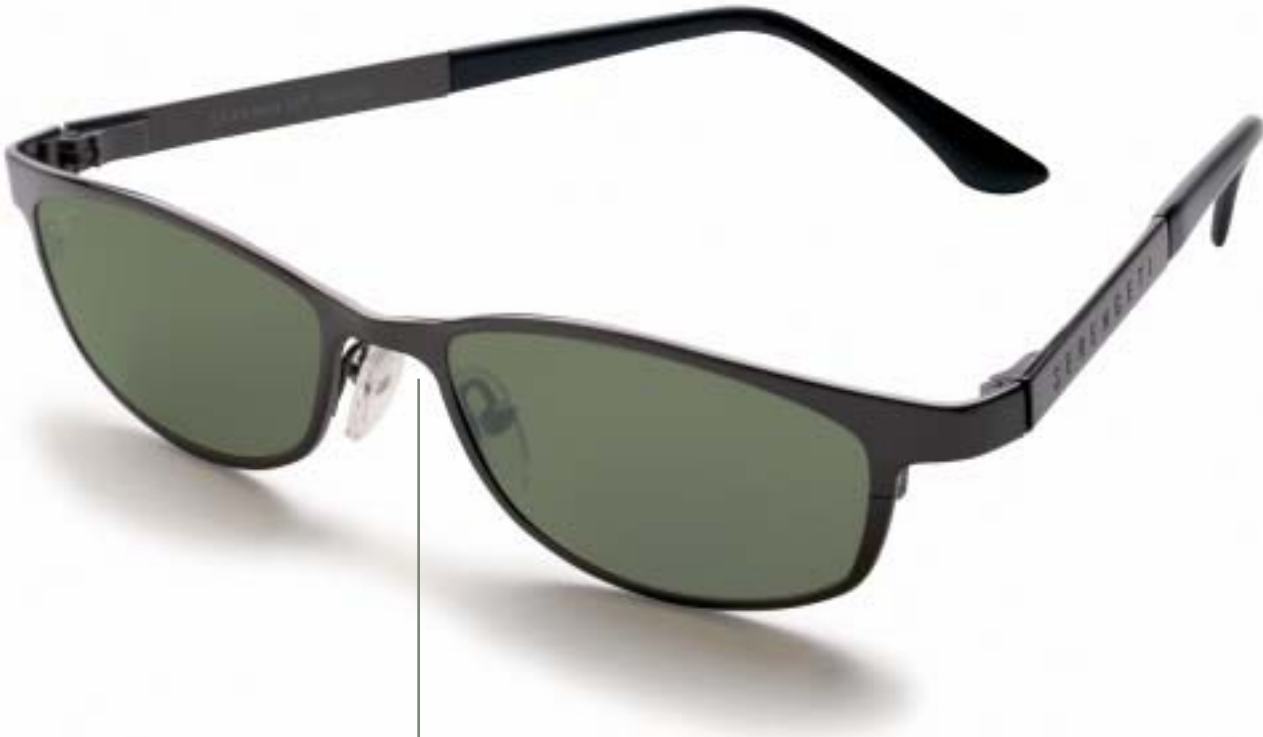
DA VINCI BASE CURVE: 6 TEMPLE LENGTH: 135MM/SPRING HINGES LENS SIZE: 51.5 X 30 X 50MM, DBL 15MM *GG6734: GUNMETAL (RX 8334, TEMPLE 7334)