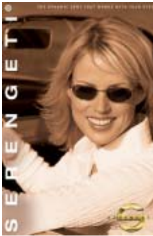
POSTERS (THE DYNAMIC LENS THAT WORKS WITH YOUR EYES)