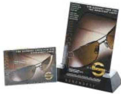
COUNTER EASEL GRAPHIC DISPLAY PR-514