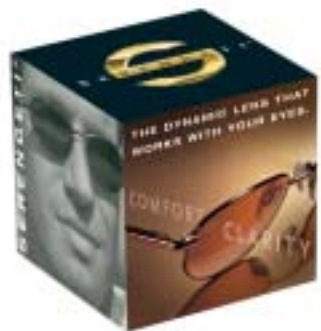
3.5" GRAPHIC CUBE SS-432