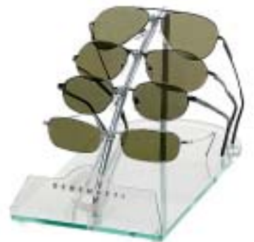
4-PIECE TIERED MERCHANDISER PR-501