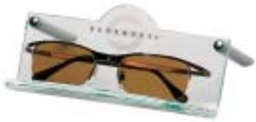
1-PIECE MERCHANDISER PR-502