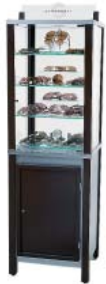
FLOOR DISPLAY (48 PIECE) 68" H x 20" W x 18" D PR-512