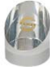
LOGO PLAQUE - ACRYLIC PR-511