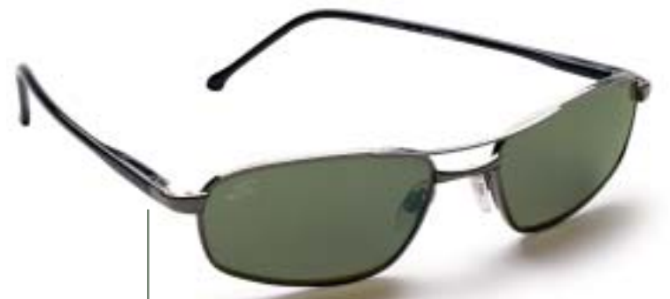
LUCCA BASE CURVE: 6 TEMPLE LENGTH: 135MM/SPRING HINGES LENS SIZE: 56 X 36.7 X 59.2, DBL 17MM *6792: GUNMETAL WITH SHINY BLACK