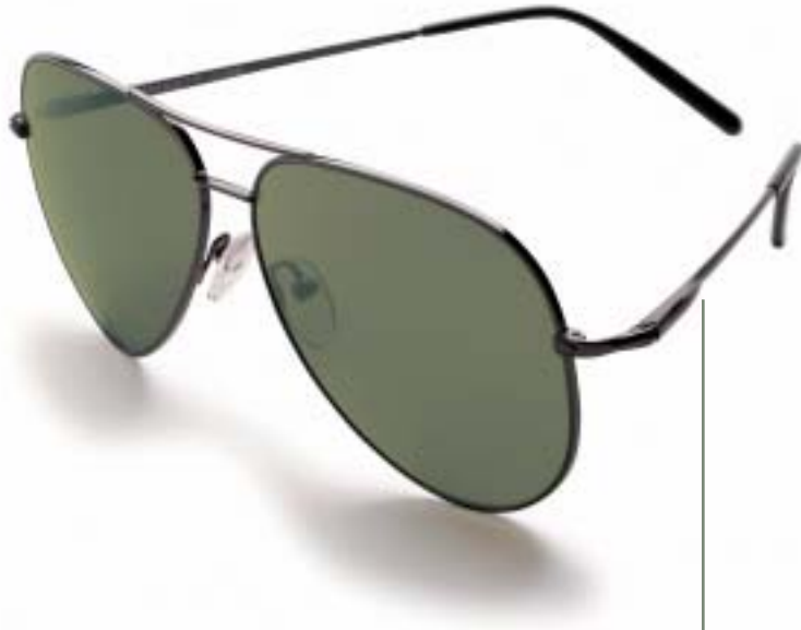
MEDIUM AVIATOR BASE CURVE: 6 TEMPLE LENGTH: 140MM/SPRING HINGES LENS SIZE: 59.3 X 51.57 X 67.02MM, DBL12.5MM *GG6785: GUNMETAL