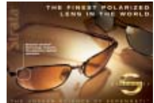
COUNTER CARD KIT (5 3/4" X 4" & 5 3/4" X 8") INCLUDES CARDS FOR, STRATA • SEDONA • DRIVERS • 555NM • SERENGETI "COMFORT/CLARITY" SS-424