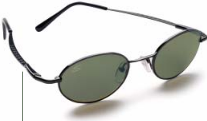
LAS RAMBLAS BASE CURVE: 6 TEMPLE LENGTH: 135MM/SPRING HINGES LENS SIZE: 47.5 X 33.5 X 44.5MM, DBL 19.5MM *GG6600: GUNMETAL (RX 8200, TEMPLE 7200)