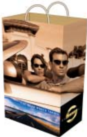
SHOPPING BAG SS-430