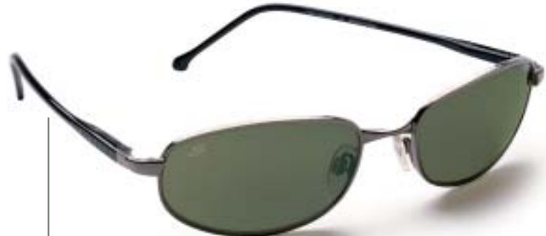
ARGOSY BASE CURVE: 8 TEMPLE LENGTH: 130MM/SPRING HINGES LENS SIZE: 56 X 35.3 X 58MM, DBL 19MM *6795: GUNMETAL WITH SHINY BLACK

15% LIGHT TRANSMITTANCE LIGHTENED STATE 8% LIGHT TRANSMITTANCE DARKENED STATE