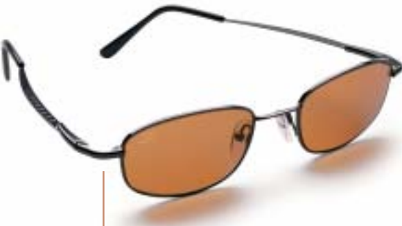
AUTOBAHN BASE CURVE: 6 TEMPLE LENGTH: 135MM/SPRING HINGES LENS SIZE: 50.25 X 31.5 X 50.75MM, DBL 19.5MM *6598: GUNMETAL (RX 8198, TEMPLE 7198) 6599: HENNA (RX 8199, TEMPLE 7199)