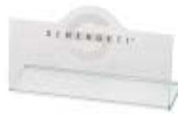
LOGO PLAQUE - BENT PLEX PR-503