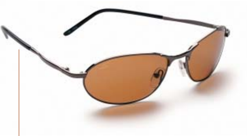
HURIKANU BASE CURVE: 8 TEMPLE LENGTH: 125MM LENS SIZE: 56 X 37.5 X 56.5MM, DBL 17MM 6534: BLACK (TEMPLE 7134) 6535: HENNA (TEMPLE 7135) *6668: GUNMETAL (TEMPLE 7268)