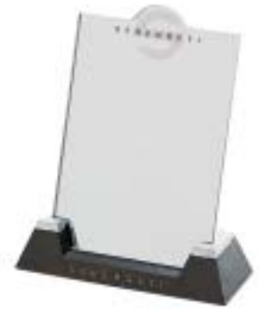
COUNTER MIRROR PR-506