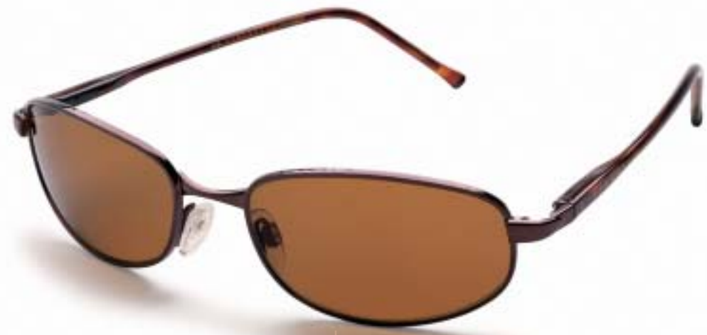
ARGOSY BASE CURVE: 8 TEMPLE LENGTH: 130MM/SPRING HINGES LENS SIZE: 56 X 35.3 X 58MM, DBL 19MM *6745: HENNA WITH TORTOISE (RX 8345)

We've combined the darkest lens in our portfolio with superior polarization to create the 555nm polarized, a lens that cools and relaxes your eyes in harsh lighting conditions.