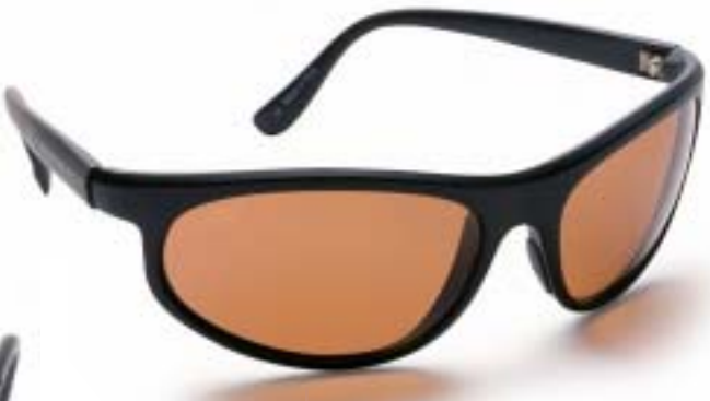
SUMMIT BASE CURVE: 8 TEMPLE LENGTH: 120MM LENS SIZE: 60.5 X 39.25 X 60.5MM, DBL 11.5MM *5602: BLACK