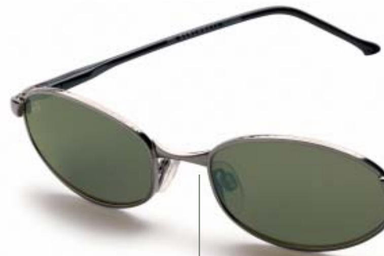
ILIAD BASE CURVE: 6 TEMPLE LENGTH: 135MM/SPRING HINGES LENS SIZE: 50 X 32.3 X 50.8MM, DBL 19MM *6794: GUNMETAL WITH SHINY BLACK